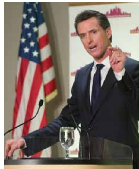
Lieutenant Governor Gavin Newsom

Newsom also emphasized that with our state in a jobs crisis, California must adapt to the fast-changing global economy and emulate successful