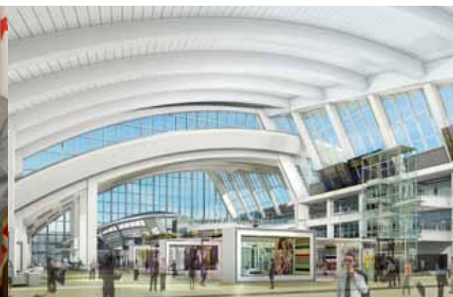
An architectural rendering of the redesigned Bradley West Terminal at LAX.