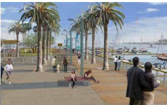
At the Port of Los Angeles, the $125 million, 700-slip Cabrillo Way Marina opens in early 2012. The state-of-the-art marina is one of several projects underway along the L.A. Waterfront.