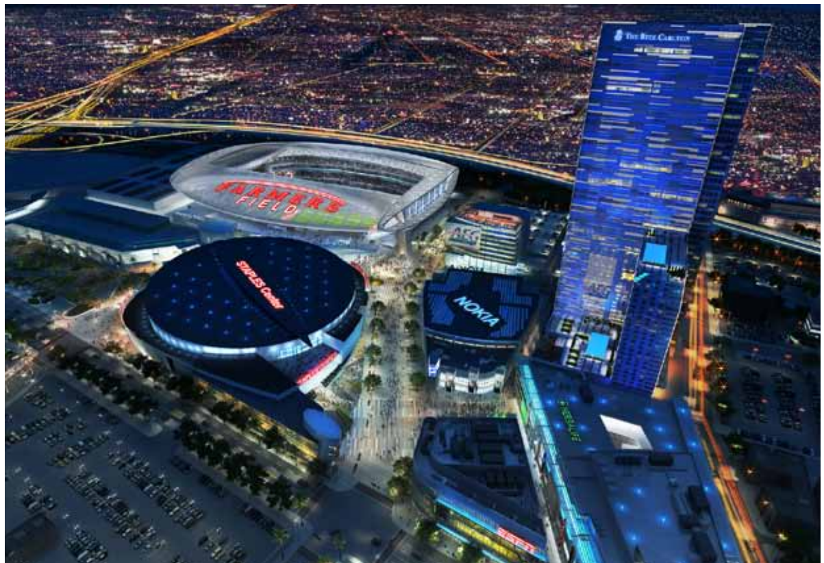
An architectural rendering of the proposed Farmers Field.

In September, Governor Jerry Brown signed SB 292 and AB 900, taking action to fast-track the creation of thousands of jobs in California and streamline the environmental review for key projects, including Farmers Field. These bills provide no exemption from environmental laws; instead, they would guarantee a thorough but expedited legal review process by elevating judicial review directly to the state’s Court of Appeal. While the best solution is to fix California’s broken CEQA law, these bills will move the dialog forward and serve as a template for broader reform that will help cure the ills that are robbing our city and state of desperately-needed jobs and investment.