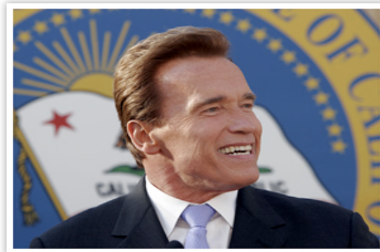
Governor Arnold Schwarzenegger