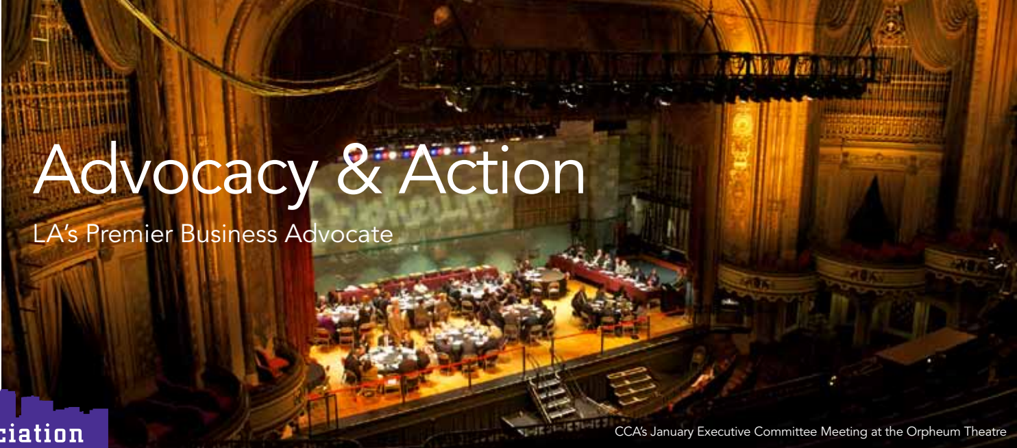
CCA's January Executive Committee Meeting at the Orpheum Theatre