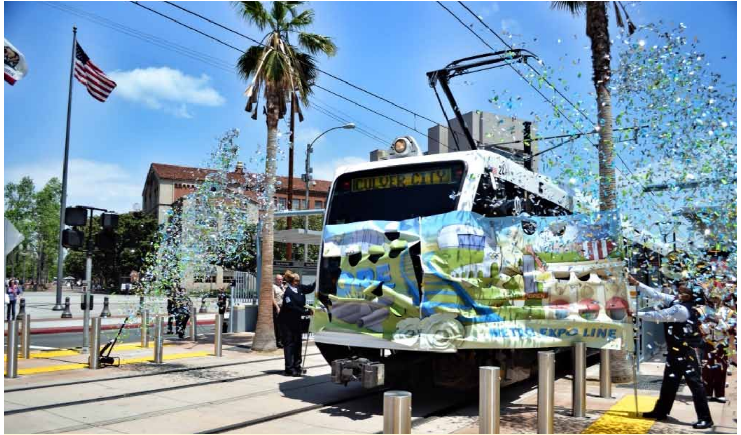
Expo Line opening ceremonies on April 28, 2012